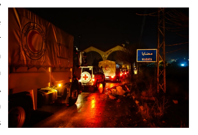
occur it is UNOCHA that needs to take Figure 4 A humanitarian relief convoy reaches the besieged Madaya

UN's response to complex emergency situations. Its mandate is to facilitate the access to regions under emergency for the prompt provision of humanitarian assistance and the supervision of such operations. The duties of UNOCHA include managing the humanitarian impact of armed conflicts. When sieges occur it is UNOCHA that needs to take action, in order to provide the civilian