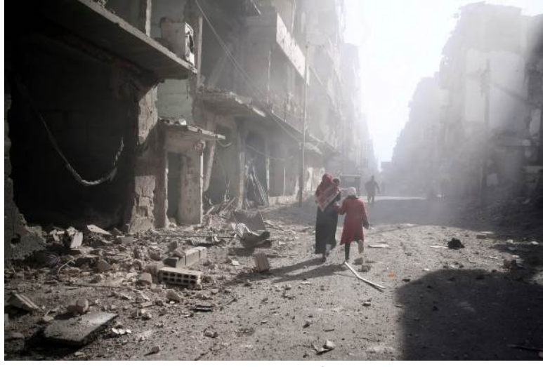
Figure 1 People walk past a damaged site after an airstrike in the besieged town of Douma, eastern Ghouta in Damascus, Syria.

eventually leading the civilians to starvation. They prevent the free movement of civilians into or out of the area, including those in need of medical attention. Electricity and water supplies to the besieged areas are usually cut off while the inhabitants are